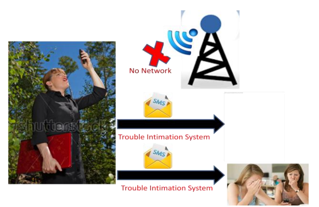
Fig: 2. Trouble Intimation system

In this paper we proposed a methodology called Trouble Intimation System, this helps to send a message alert to your dearest ones and to the nearest police station when you are in a trouble and where your mobile is not having the network signal.